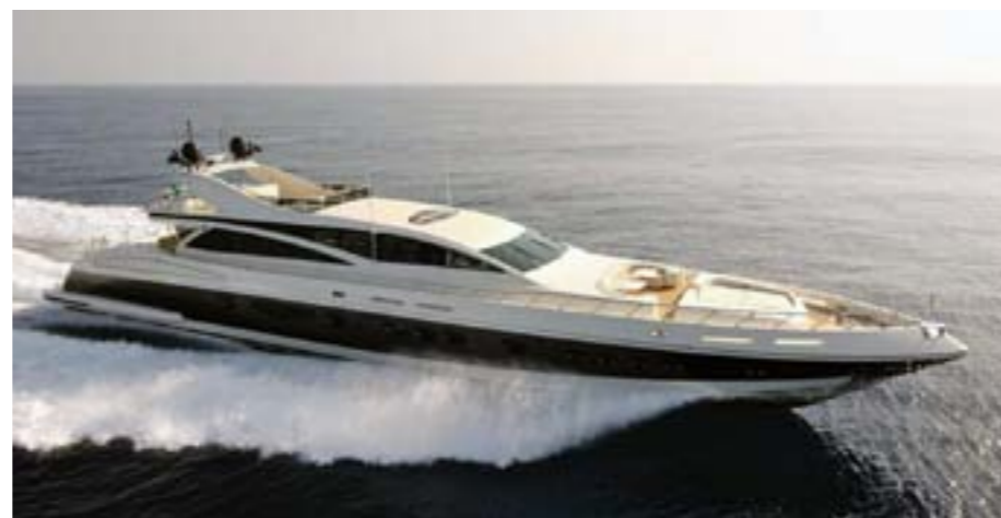
As gyroscope specialists luxury yachts are a major market segment for Seakeeper.

state-of-the-art engineering and manufacturing, Seakeeper was able to modernize the existing gyro technology to reduce the natural roll of a boat by more than 70 percent. This is quite an improvement considering that a boat's natural roll has the potential to be three to five times the slope of a wave. While there are many applications (for example fins, tanks, flopper stoppers) that work to reduce roll at a boat's natural period, an actively controlled gyro is the only stabilization device that will reduce roll at all speeds and sea conditions. According to Seakeeper, its updated gyro innovation – a "Control Moment Gyro" (CMG) – employs the physics of gyro-dynamics. Seakeeper offers two CMG models. Model 8000 is applicable to boats between 40 and 80 feet, while Model 21000 is applicable to boats 80 feet and up (boats over 100 feet typically require multiple gyros). What separates Seakeeper's product from its competitors is that the gyro flywheel operates in a vacuum, which reduces air drag and enables a more efficient system. The system, which is mounted inside the hull structure aft of amidships, has a heavy flywheel that spins at high speed in a near vacuum to produce a gyroscopic torque that exerts a powerful righting torque to counteract boat roll. The unit also includes an active control mechanism, which optimizes the gyro's performance over a wide range of sea states.