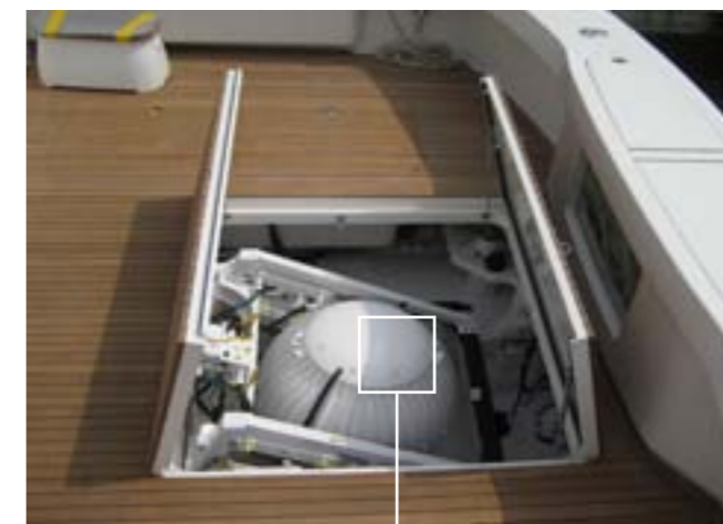
Gyroscopes are capable of reducing and virtually eliminating a boat's natural roll.

Seakeeper's updated "Control Moment Gyro" (CMG) relies on Simrit and its microcellular technology for a customized solution.