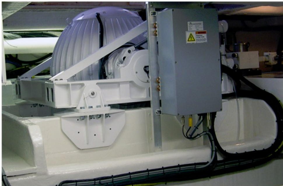
The Nordlund yacht Mixer and her Seakeeper M21000 gyro installed.

105' Nordlund Motor yacht Mixer equipped with Seakeeper Gyro.