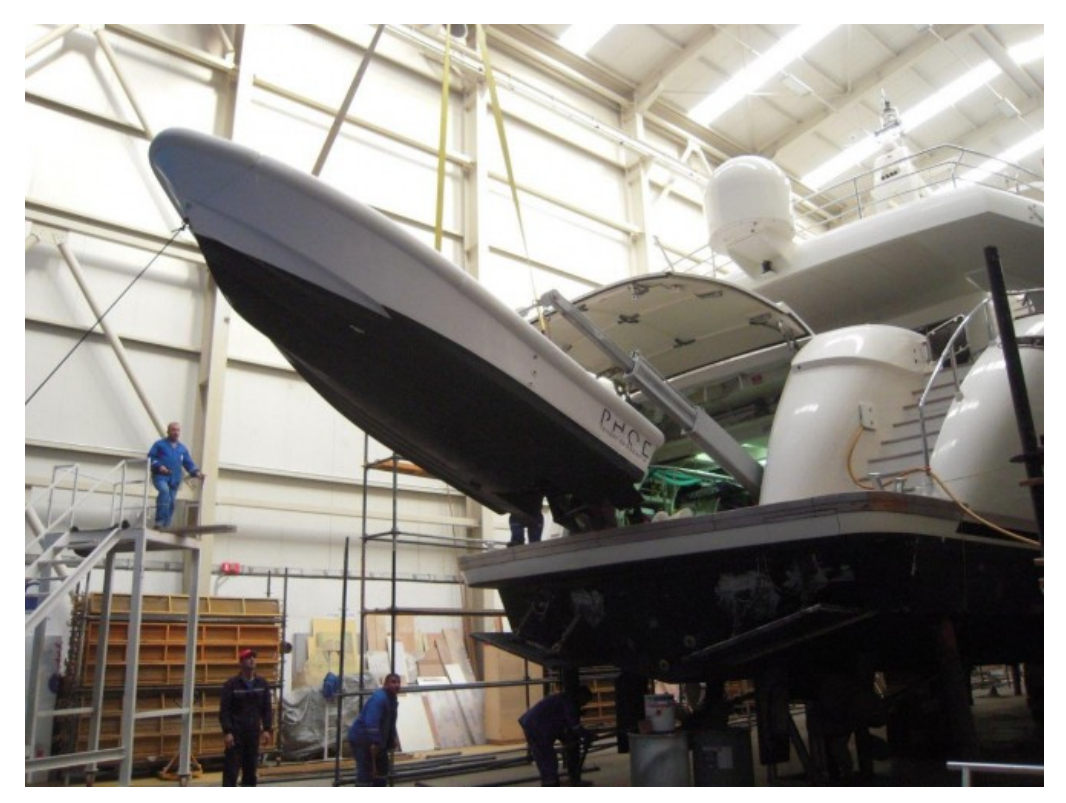
Works on the refit of Phoenix Yacht

The 36 metre, epoxy composite, motor yacht Phoenix was hauled out at the AES facility on November 20th. Delivery date was set for 6 months maximum, or mid May 2013.