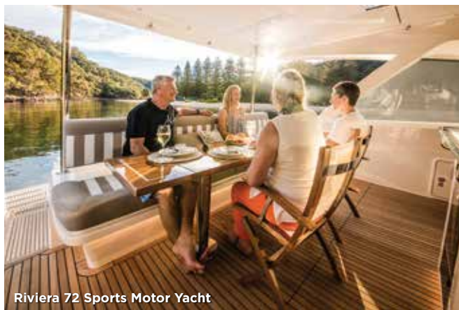
Riviera 72 Sports Motor Yacht