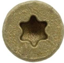
Figure 1: #10 x 2" Screw Head

To improve security and availability of component supply, Seakeeper is changing the crate fasteners for Seakeeper 1 – Seakeeper 9 models. The overall crate dimensions will remain the same, with updated fasteners to secure side and top panels. The metal clips that were installed on the edges of the crate will be replaced by #10 x 2" 6-Lobe Flat Head Deck Screw. A Torx T-25 bit is used for installation and removal, as shown in Figures 1 and 2.