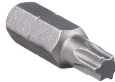
Figure 2: Torx T-25

All models that are shipped with screw-secured panels will have black markings to indicate which fasteners need to be removed from unpacking. See Figure 3 for example of the markings.